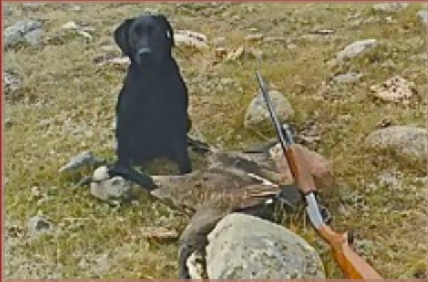
Brock with the "infamous" Goose in the Story